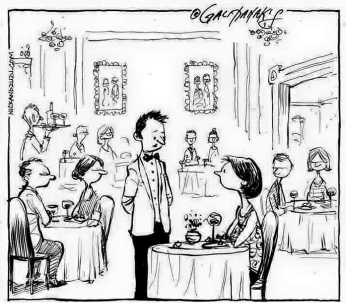
WE'RE GOING TO RELOCATE 40U TO THE BAR. 40UR CONTENTMENT IS UNNERVING THE COUPLES.

Having sat on my own for dinner more times that I care to remember, this cartoon really made me laugh recently.